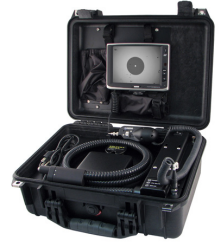
Fiber Cleaning System