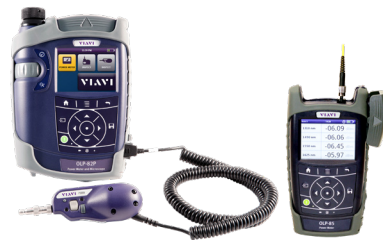
SmartClass family OLS 85/86, OLP 85, ORL 85 Selective \lambda light sources and power meters