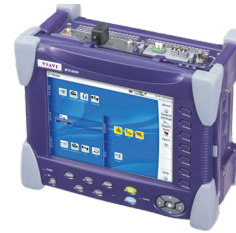
T-BERD 8000 Fiber Characterization TB8000-FCX