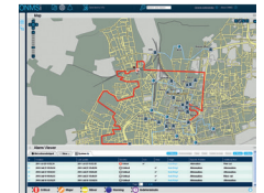
ONMSi Optical Network Monitoring System ONMSi Optical network test and monitoring system for Core, Metro, Access and FTTH networks