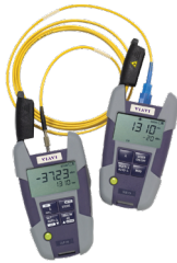
Optical Loss Test Kits 2127/xx