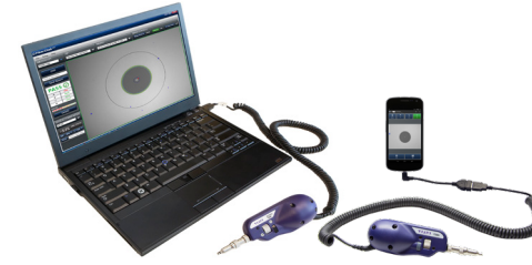
USB Digital Inspection Kits FBP-SD101/FIT-SD103